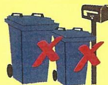
Objects & Carts Too Close Together