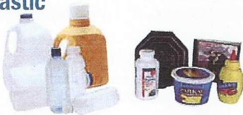
Plastic Jugs/Bottles/Household Plastic Empty containers only