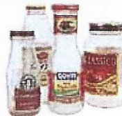
Empty & Clear Bottles & Jars Only