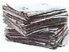
Newspaper Remove bags, strings & rubber bands