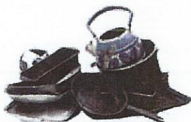
Kitchen Cookware Metal pots, pans, tins & utensils