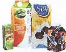
Food & Beverage Containers Empty containers only