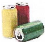
Aluminum Cans Empty cans only