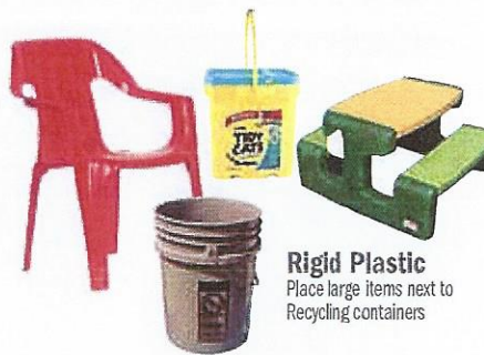
Rigid Plastic Place large items next to Recycling containers