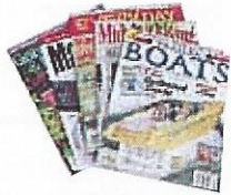
Magazines & Catalogs All types & sizes