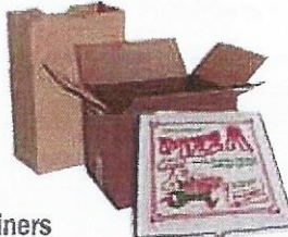
Cardboard, Pizza Boxes & Paper Bags Flatten cardboard & cut into pieces. Remove wax paper from pizza boxes