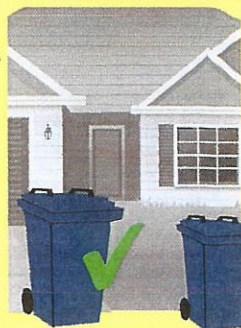
Place Wheels of Carts Toward House

Like us on Facebook for Recycling Tips & Info facebook.com/ModernDisposal