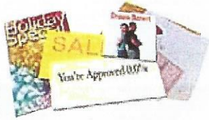
Office Paper & Junk Mail Envelopes, Flyers, Brochures, Postcards, etc.