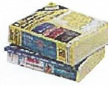
Phone Books All types & sizes