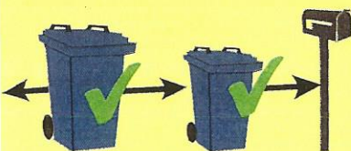
Keep Space Between Cart & Other Objects