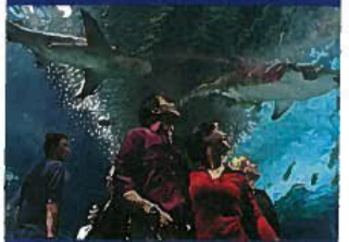
Incredible Creatures at Newport Aquarium