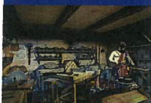
View from Inside the Ark Encounter

Diamond Tours inc. Bringing Group Travel to a Higher Standard®