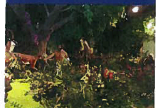
Visit to the Amazing Creation Museum!