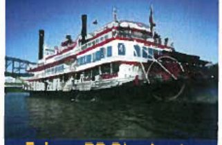
Enjoy a BB Riverboats Sightseeing Cruise